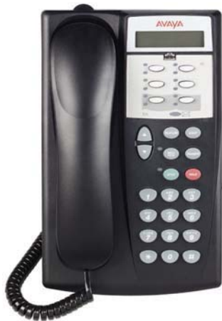
PARTNER 6-button display phone

Transfer a call...set up a conference call...create a list of frequently dialed numbers — PARTNER telephones make it easy. It's also simple to connect standard devices — no extra lines or adapters needed.