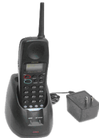
PARTNER 3910 MultiLine Wireless Phone