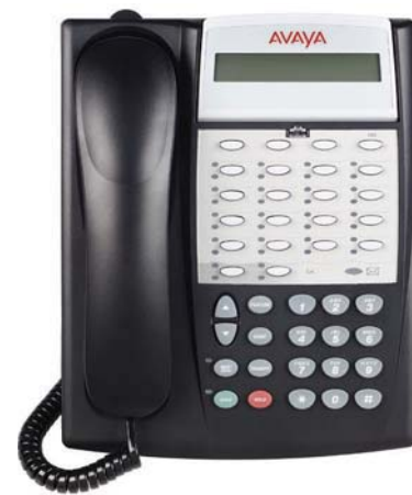
PARTNER 18-button display phone